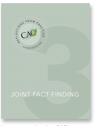
Learn more and explore CAO's 'Reflections from Practice' series at www.cao-dr-practice.org.

Development-related conflicts involving disputes of fact between affected people and project sponsors occur across all sectors, from mining and agribusiness to infrastructure and manufacturing. These disputes are often caused by concerns about project impacts. "Joint Fact-Finding" is a dispute resolution tool that provides the opportunity for the parties to explore ways to jointly collect, analyze, and interpret data and build consensus around it. The new publication outlines the principles and strategies to consider when developing a Joint Fact-Finding process. Learn more at www.cao-dr-practice.org