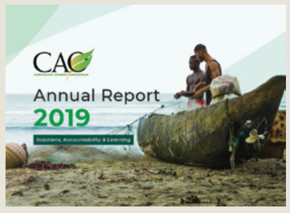
CAO's 2019 Digital Annual Report, www.cao-ar19.org