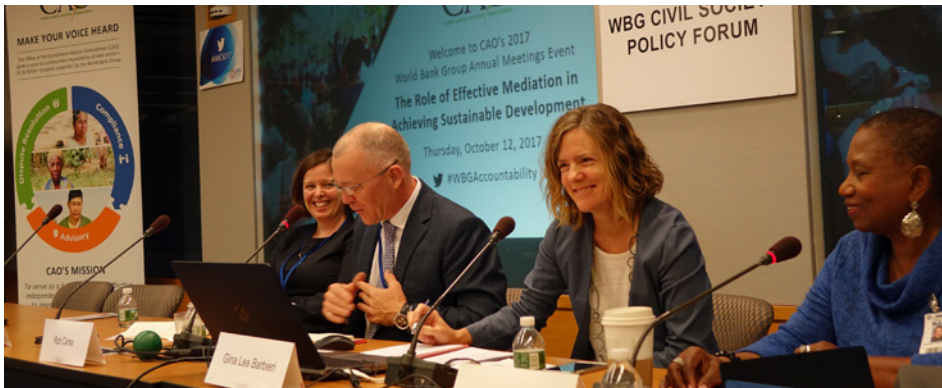
Panelists representing civil society, the private sector, mediation professionals, and CAO discuss the use of mediation in community-company disputes at CAO's WBG Annual Meetings policy session, Washington, D.C., October 2017.

In November, CAO participated in a workshop organized by the African Coalition for Corporate Accountability (ACCA) in Pretoria, South Africa. ACCA is a coalition of 116 organizations from over 30 African countries which supports African communities and individuals whose human rights are adversely impacted by the activities of multinational and domestic companies. Representatives from CAO, IFC, the World Bank, and Asian Development Bank participated in a session which focused on the accountability policies and practices of multilateral development banks (MDBs) in Africa. CSO participants reiterated the need for greater transparency and effective consultations before projects are approved and greater clarity about the role and mandate of MDB accountability mechanisms such as CAO. For more information, please visit the ACCA website.