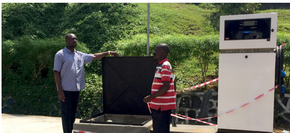
The implementation of agreements is underway in Cameroon as a new fuel pump is installed at the fishermen's cooperative in Kribi, Cameroon, November 2017.

Several mediated agreements have been reached between communities and the Cameroon Oil Transportation Company (COTCO), an Exxon-managed and co-owned company which manages part of the Chad-Cameroon pipeline. The IFC-supported project involved the construction of a 1070 kilometer (km) pipeline to transport crude oil from three fields in southwestern Chad to a floating facility 11 km off the Cameroon coast. IFC's investment consisted of a $100 million loan from its own account and a $100 million loan syndicated to over 15 commercial banks. CAO has overseen a mediation process since 2012 addressing a complex set of issues and disputes including the spread of HIV/AIDS, loss of livelihood, and physical displacement. By 2014, agreements had been negotiated and fully implemented addressing four individual complaints. This past year, settlement was reached on complaints from three communities: local