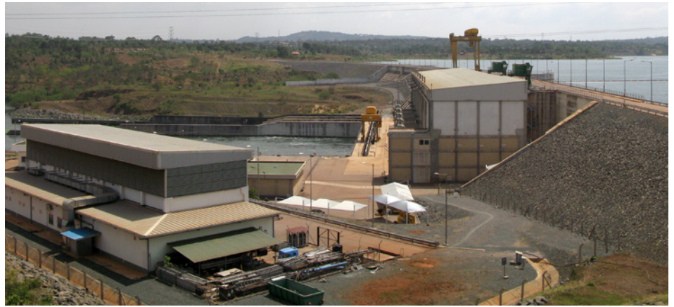
CAO visits the Bujagali Energy hydropower project in Uganda, January 2017.

CAO has received seven eligible complaints related to the Bujagali hydropower project in Uganda over the past 16 years, as well as a number of ineligible complaints. The project is valued at $750 million and comprises the construction and maintenance of a run-of-the-river power plant on the Nile River, as well as a 100 km transmission line. It is a public-private partnership being undertaken by Bujagali Energy Limited which has received a $130 million loan from IFC and a $115 million guarantee from MIGA, in addition to financing from other commercial and international development banks. The complaints to CAO from local communities and workers have raised numerous concerns and alleged harms related to: occupational, health and safety (OHS); lack of compensation for work injuries; unpaid wages and benefits;