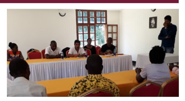
Parties discuss ways to work together to create economic initiatives in Kalangala, Uganda, December 2017.

CAO has concluded a dispute resolution process in Uganda between a small farmers association and Bidco Africa, a consumer goods company and IFC client. CAO closed the case after ascertaining that the land compensation agreement had been implemented. The dispute resolution process was convened to address a complaint sent to CAO in January 2017 by the National Association of Professional Environmentalists (NAPE) on behalf of 38 farmers living near palm oil plantations in Kalangala, near Lake Victoria. The plantations are operated by Bidco Africa's Ugandan subsidiary, Oil Palm Uganda Ltd (OPUL). The complaint raised concerns regarding the impacts of deforestation, environmental damage, lack of compensation for lost land, reduced