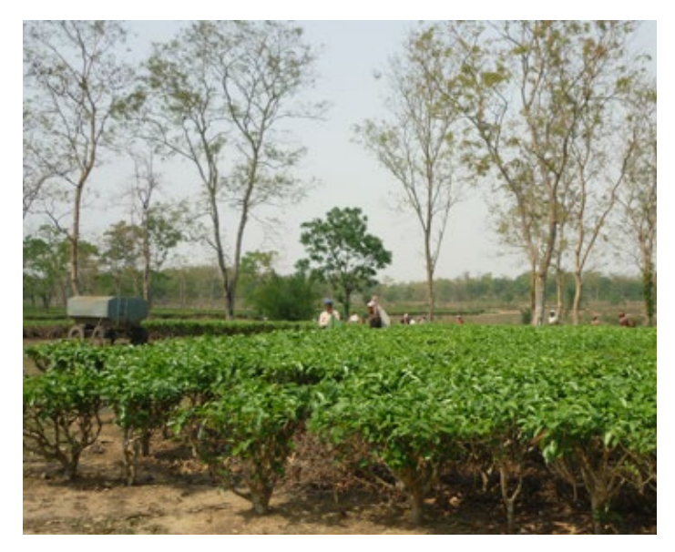
Workers on an APPL tea plantation in northeast India (CAO).

In response to the investigation report, IFC noted that APPL was implementing an Action Plan to address shortcomings and legacy issues in key areas as human health, worker health and safety, housing, and sanitation infrastructure. Since the release of CAO's investigation report, APPL has reported progress in implementing some of the Action Plan commitments. However, the complainants assert that workers were not consulted on the Action Plan and raise concerns with the progress and quality of its implementation.