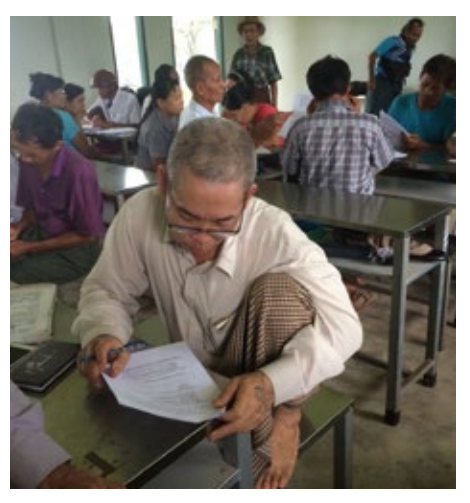
CAO meets with community members near Hmawbi to build capacity ahead of the dispute resolution process in Myanmar.

During the February meeting, the parties, which include representatives from the company's plant, and the local community (which is supported by six NGOs), began discussions about water pollution concerns and how to prioritize their dialogue moving forward. More information about the case is available on CAO's website, www.cao-ombudsman.org.