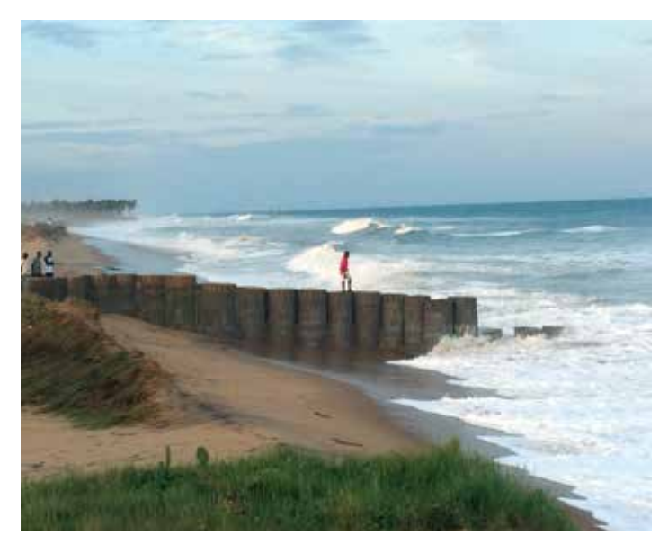
Lomé, Togo.

IFC has issued a formal response to the investigation and CAO is monitoring IFC's actions to the investigation findings.