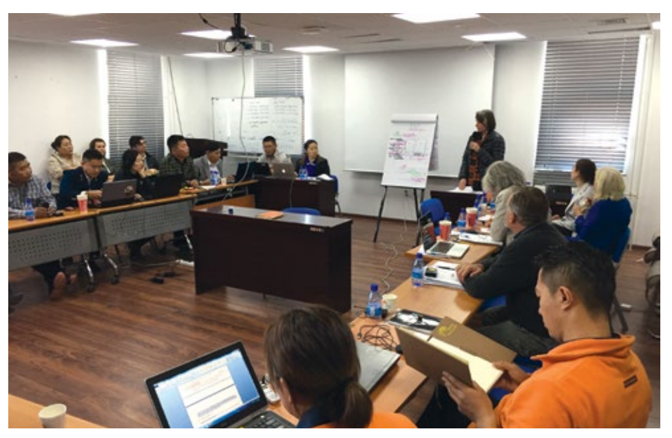
Herder, company and government representatives (Tri-Partite Council) meet with independent experts, Mongolia (CAO).

In May 2017, representatives of local herder communities, Oyu Tolgoi LLC, and local government reached agreement on a series of actions to address complaints related to the Oyu Tolgoi copper-gold mine in the South Gobi, Mongolia, which is managed by Rio Tinto and supported by IFC and MIGA. The herders and company have been participating in a CAO mediation process since 2013 and have tackled issues together relating to water, resettlement, economic displacement, human and animal health, cultural heritage, and rangeland impacts and management, among others. The process has resulted in a number of outcomes including joint fact-finding by a group of independent experts jointly selected by the parties to assess the impacts of a river diversion and a socio-economic study of herder households; access to grazing land inside the mine license area; tours and inspections of the mine site for herders; interim agreements on topics such as access to information: and the establishment of a "Tri-Partite Council" including herders, local government, and company representatives. While CAO's mediation process has concluded, CAO is monitoring implementation of agreements and assisting the parties where necessary. Details on the final agreements are available on CAO's website.