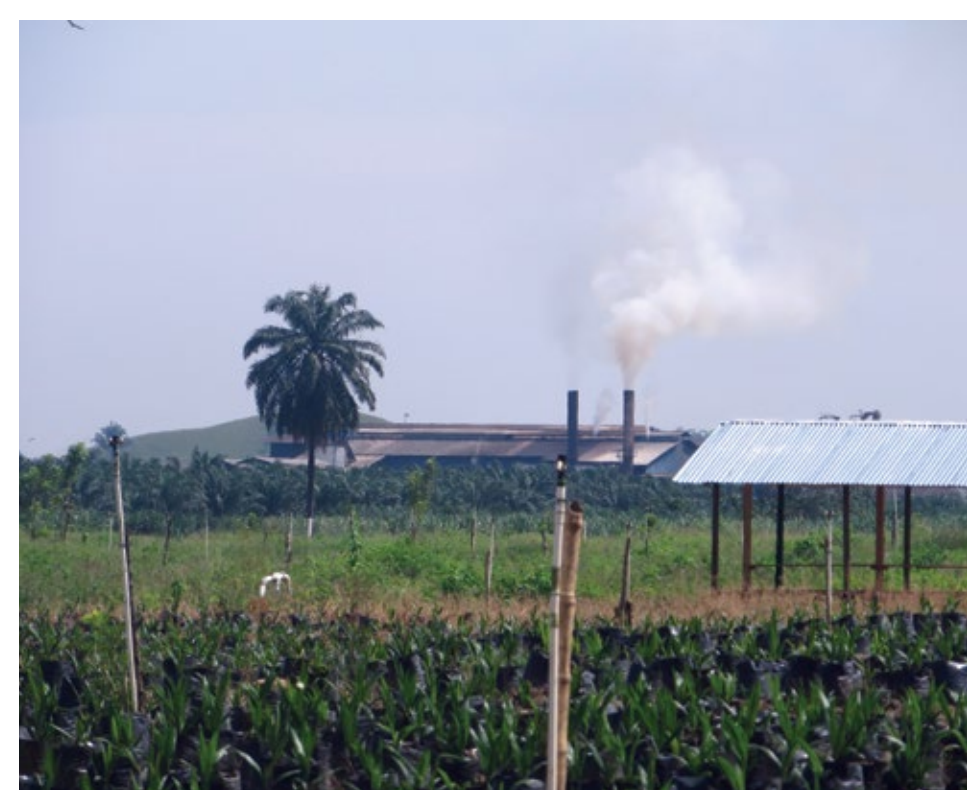
Corporacion Dinant palm oil operations, Honduras (CAO).

to those covered in CAO's 2014 <u>audit</u> of IFC's investment in Dinant. As a result, CAO is considering the issues raised by these complaints as part of its ongoing monitoring of the 2014 Dinant audit. CAO expects to publish its next monitoring report later in 2017.