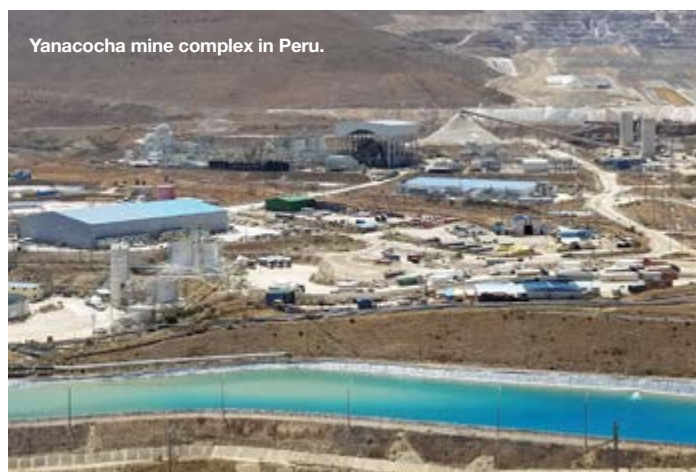
Yanacocha mine complex in Peru.

CAO's monitoring considered actions taken by IFC to address supervision shortcomings during the period of IFC's financing. During this monitoring phase, IFC obtained documentation that indicated that the company provides medical records to active workers. In an update to CAO, the company noted that, in July 2020, it had a procedure for former workers to request and receive their medical records and that this had recently been communicated to former workers.