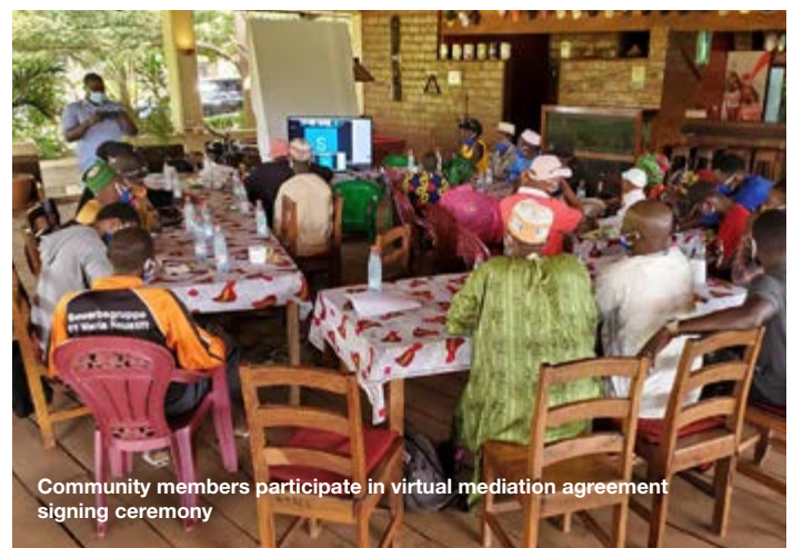
Community members participate in virtual mediation agreement signing ceremony

engagement in discussing and addressing the substantive social and environmental issues raised in the complaint. More information about the case is available on CAO's website.