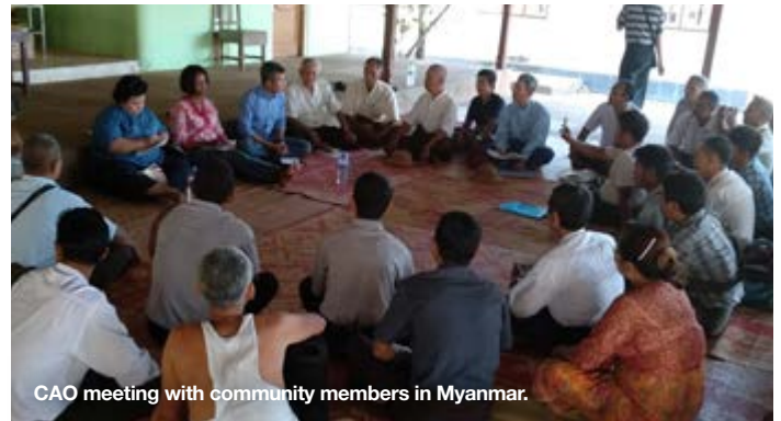
CAO meeting with community members in Myanmar.

transferred to CAO's compliance function in June 2020. CAO's appraisal raises questions concerning IFC's environmental and social review and supervision of the project, particularly in relation to two pesticide plants. Details about the scope of CAO's investigation are available on CAO's website.