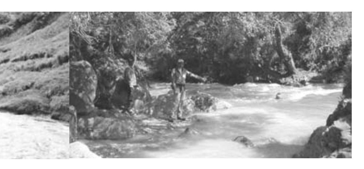
Members of the CAOsponsored water study team test water quality and quantity near Cajamarca, Peru.

One example of how the compliance role can extend the reach of an ombudsman intervention to help resolve environmental and social issues is the recently completed capacity review of Bolivia's Compañia Minera del Sur (see story on page 12).