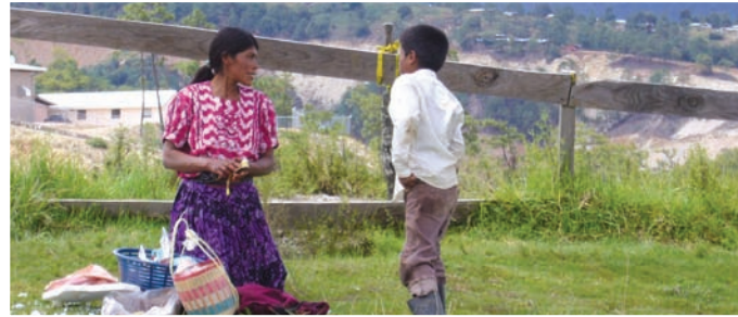
Residents of Sipacapa, near the Marlin gold mine in Guatemala.

In December 2005, a representative of the complainants, together with national and international NGOs, met in Washington, DC with World Bank Group President Paul Wolfowitz. At the request of the president, the CAO returned to Guatemala in January 2006 to assess the willingness of the parties to engage in a mediated dialogue. The assessment revealed that neither the complainants nor the company were willing to engage in a dialogue process led by "outsiders," including the World Bank Group. The CAO has requested that the IFC client publicly report on progress relating to the CAO recommendations made in September 2005, and that it carefully assess the risks of continuing exploration activities. We have also made recommendations for greater coordination between IFC and the World Bank Group in the mining sector in Guatemala. We have closed the complaint, but are prepared to re-engage at the request of the parties.