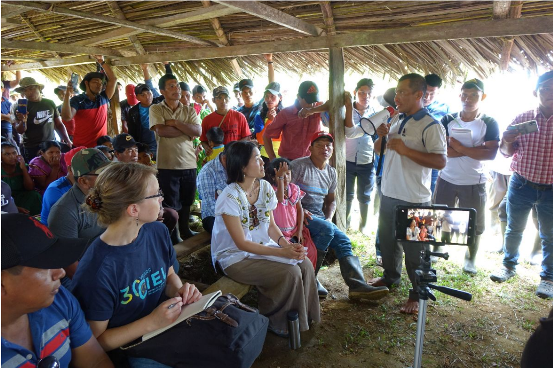
Community Meeting in Norte de Santa Fe, Panama - May, 2023.

In preparing this pilot report, CAO verified IFC’s effective implementation of corrective actions in the MAPs and engaged with IFC project teams to validate MAP implementation. CAO also engaged with complainants and their representatives to discuss and document the adequacy of IFC’s actions and implementation and review supporting documentation received from parties.