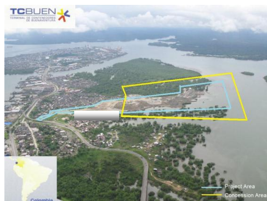
Figure 3 Location of the Malecón project, mentioned in the first version of the complaint and not linked to an IFC investment 7